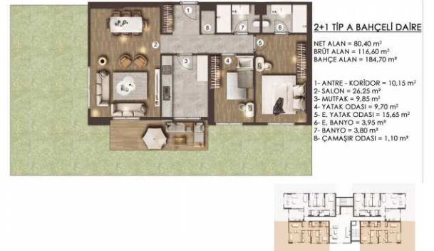
ZEMİN KAT PLANI