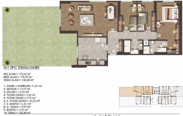
1. KAT PLANI